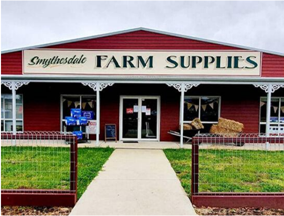
SMYTHESDALE FARM SUPPLIES

A BIG THANK YOU TO OUR WONDERFUL SPONSORS