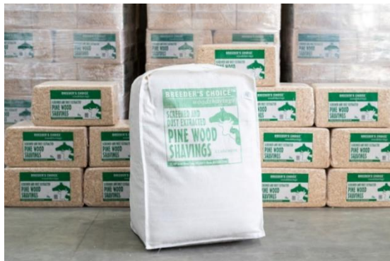
BREEDERS CHOICE WOOD SHAVINGS